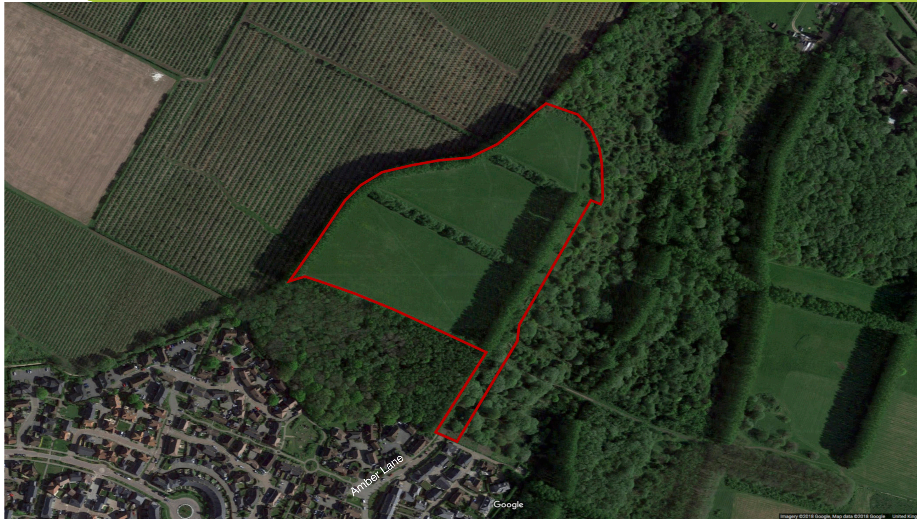
Aerial view of Site 5.4