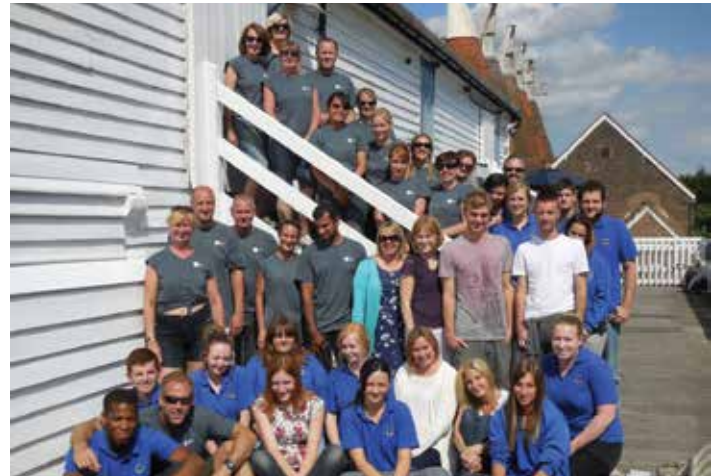
Liberty staff in grey T shirts with Quest school staff in blue shirts

"Our job was to prepare the external weatherboarding