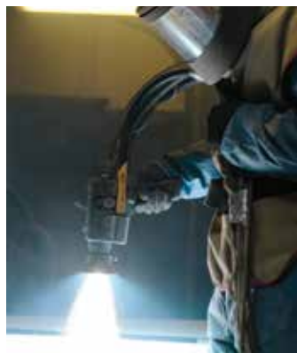
Fabricators working on the artworks

The works were inspired by stories and poems about Kings Hill's past as RAF West Malling and were gathered through workshops run with local residents, schoolchildren, Kings Hill businesses and