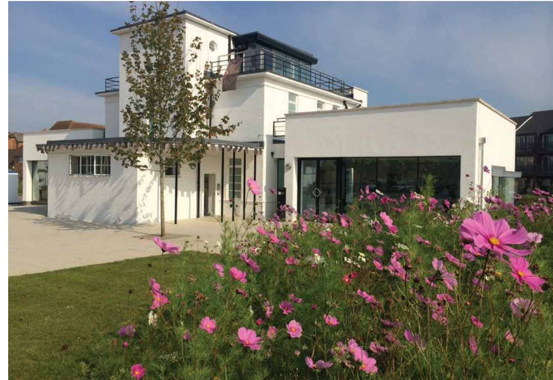
Award-winning landscaping around the Control Tower with Cosmos

The landscaping at Kings Hill has scooped three silver gilt awards in this year's South & South East in Bloom competition in the Conservation Area, Village Centre and Business Landscape categories – and in the latter it was only three marks off a gold medal.