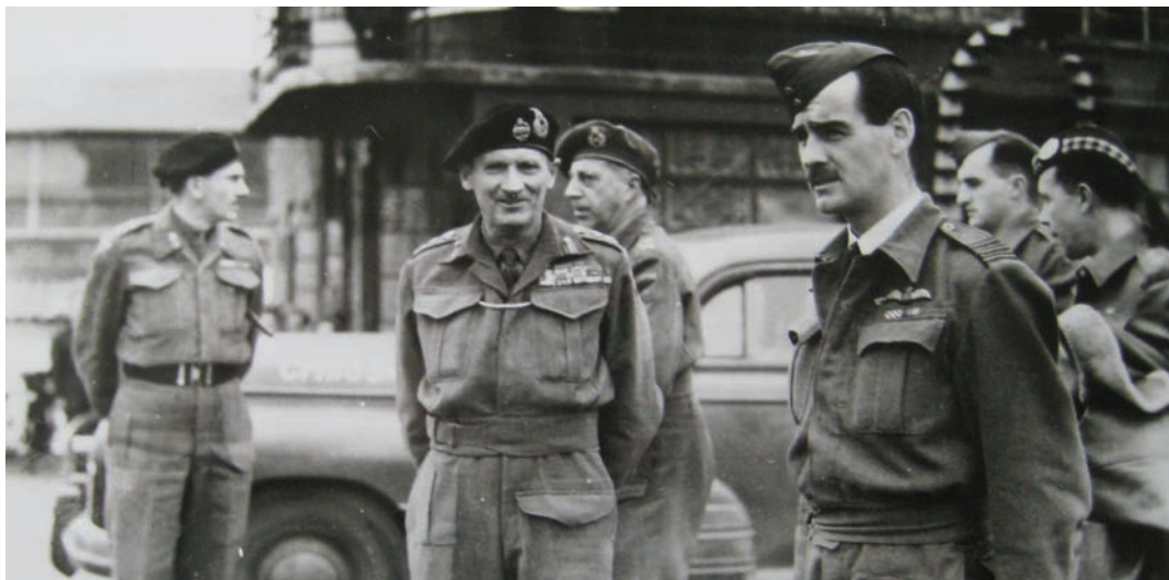
General Montgomery at RAF West Malling in 1944, outside the Control Tower

Some 300 people visited the Control Tower during the national Heritage Open Days – which celebrates England's architecture and culture by offering free access to properties that are usually closed to the public or which charge for admission.