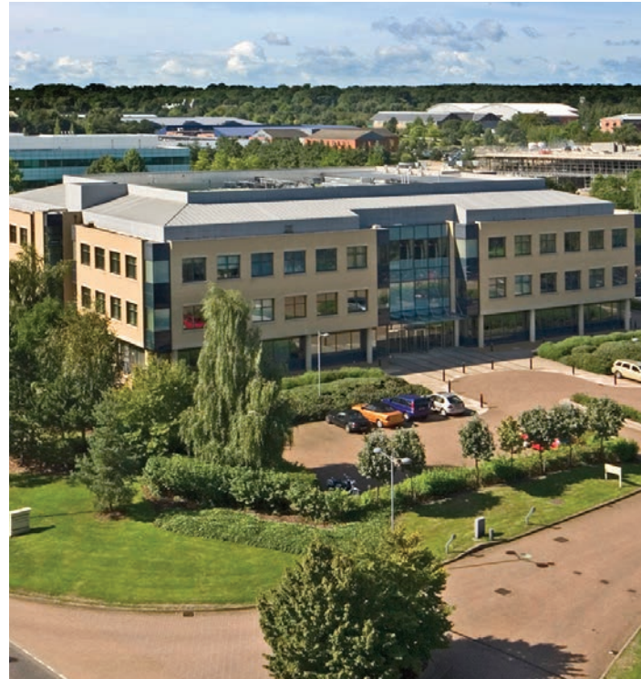
Travel Insurance Facilities Group's new home

Also new to Kings Hill is Future Home Care, which helps adults with disabilities live independently in their own home. It will now be based in 2 Kings Hill Avenue with its sister company Lifeways Community Care Ltd.