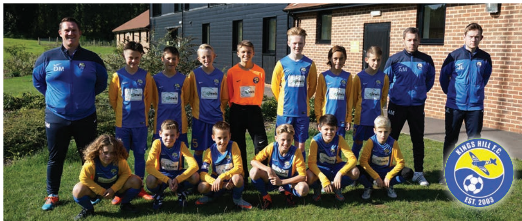
U13's Kent Youth League Team

Kings Hill Football Club goes from strength to strength with now close to 400 players and 32 teams playing in eight different county leagues including the Kent Youth League (KYL). Almost three quarters of players are Kings Hill residents.