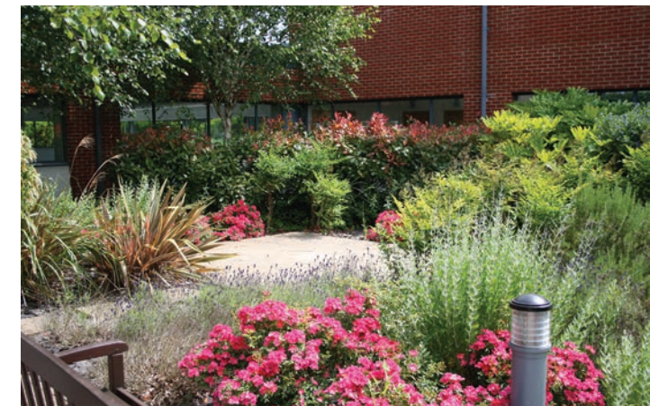
Winning business park landscaping

understand how important it is to create an attractive and relaxing environment for people working, living and visiting here. To have the endorsement of the judges – as well as their comments on how we can make things even better – is proof that we are succeeding."