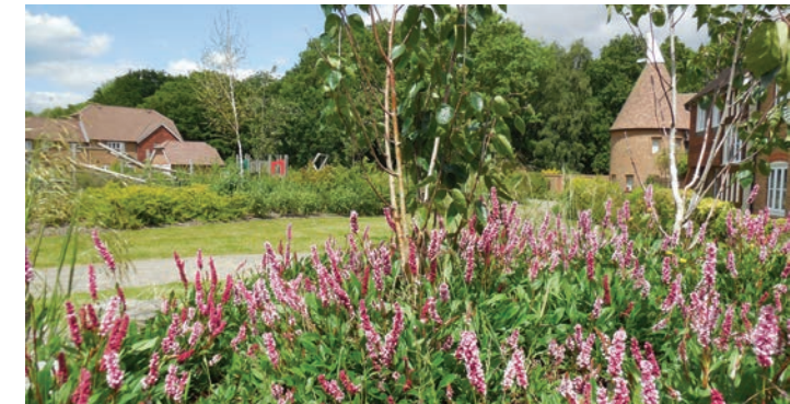
Landscaping around the greenway Emerald Walk

There is also a ten-year plan worked up with Susan Deakin Ecology to ensure the 50 acres of Conservation Area of natural and ancient woodland is protected and strictly managed in a