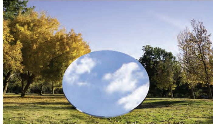
Possible 'sky mirror' - inspired sculpture

As Kings Hill is one of the highest points in Kent, the new park is intended to be 'a celebration of the big skies of Kent' but as yet it has no name, so if you would like to suggest one please email your ideas to wsmitherman@libertyproperty.com .