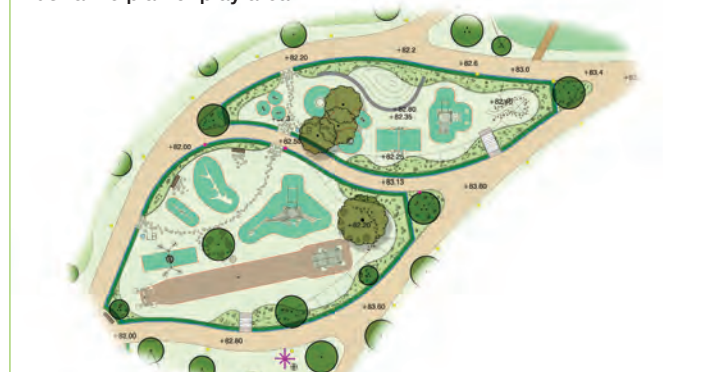
Illustrative plan of play area