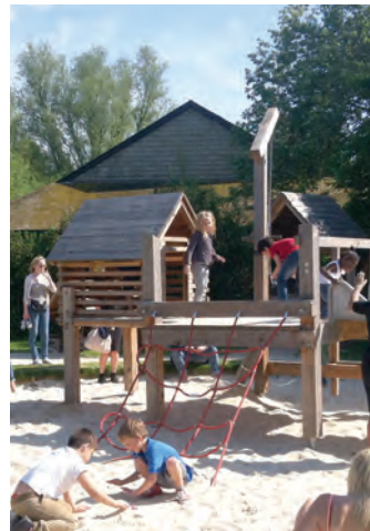
Natural play equipment

The park will be set within the new residential neighbourhood and accessed by two new roads – one to the north and one to the south – linking the roundabout on Tower View and the roundabout on Beacon Avenue, forming an elliptical shape.