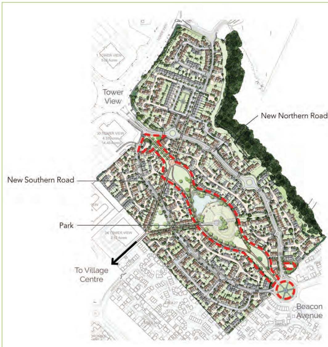
Illustrative plan of the new residential neighbourhood