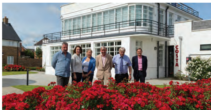
Judges admiring the winning landscape

Gold was given in the 'Business Landscape of the Year' category and silver gilt in 'Village/Town/City Centre'. The judges, who included TV gardener Jim Buttriss, commented on the variety of planting and the emphasis on conservation.