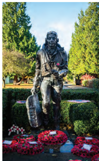
The Running Airman sculpture

On Christmas Day, All-Age Communion will be held at the Discovery School at 10am and the Christian Fellowship is holding All-Age Worship in the Community Centre at 10.30am.