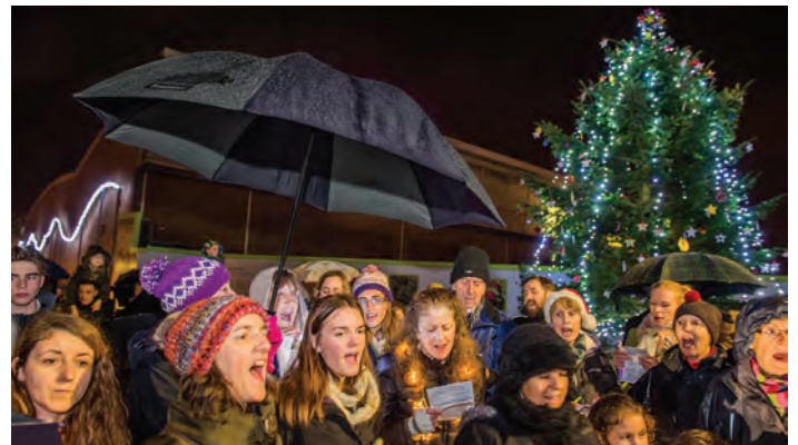
Singers enjoying the carol concert

People were very generous in donating bedding for the Pilsdon Community, a charity offering a refuge to people in crisis, and toys for the Salvation Army Christmas Present Appeal.