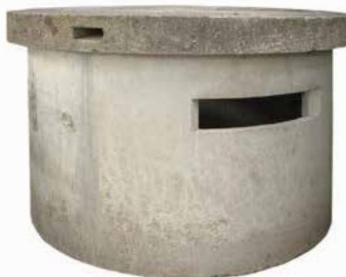
A Pickett-Hamilton fort

Key to the design of the park was how to incorporate the fort whilst preserving the landscape that originally surrounded it – and this is the main change to our original proposals.