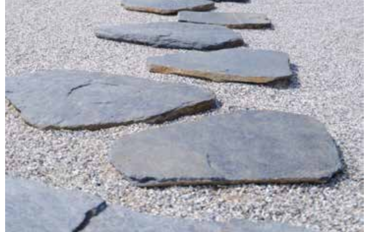
Indicative landscape elements