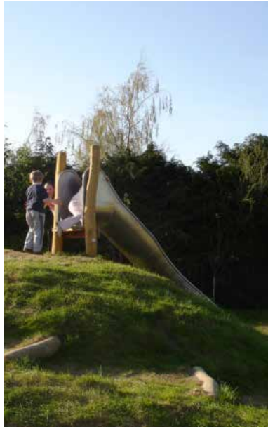
Indicative play area

The park will be located in the centre of the new residential neighbourhood and will run from Tower View in the west to Beacon Avenue in the east, carefully orientated to take advantage of the sun at all times of day.