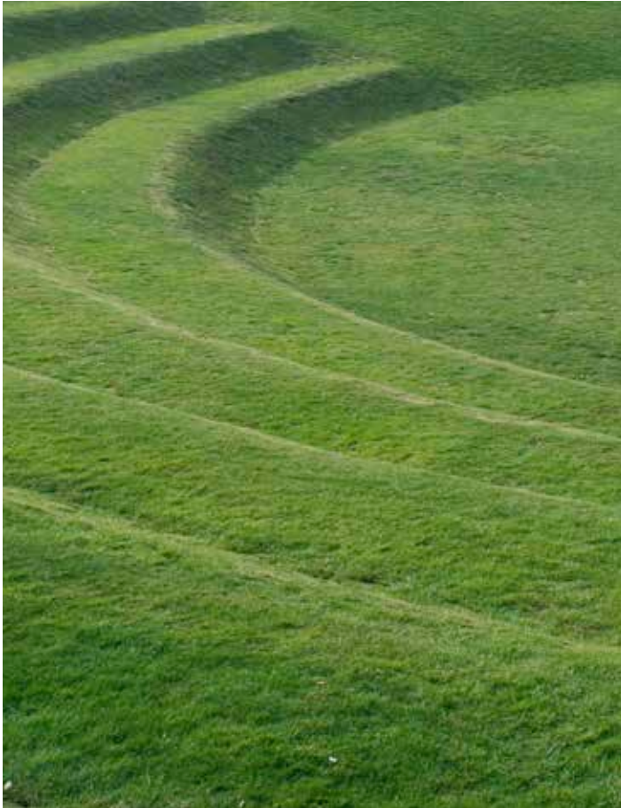
Indicative grass amphitheatre