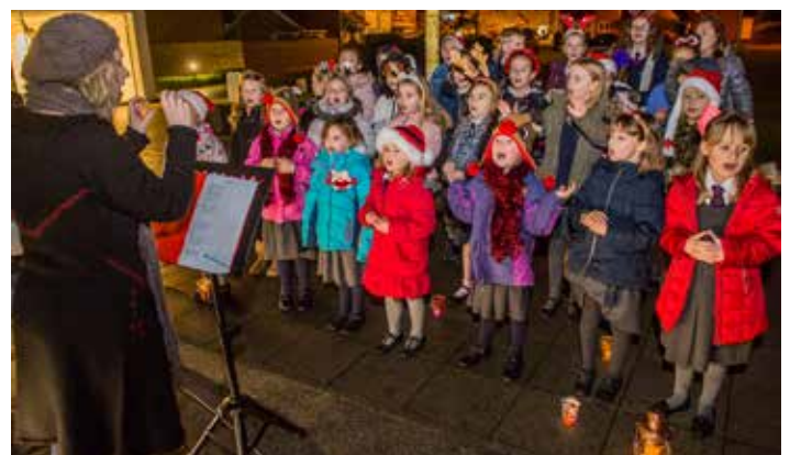
Christmas carols in Liberty Square 2016

For more information visit https://www.salvationarmy.org.uk/christmas-present-appeal . If you can't make the event you can also donate presents at the Vicarage before the event or at the St Gabriel's toy Service on Sunday 3rd December 10am.