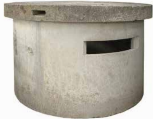
A Pickett-Hamilton fort

Key to the design of the park was how to incorporate the fort whilst preserving the landscape that originally surrounded it – and this is the main change to our original proposals.