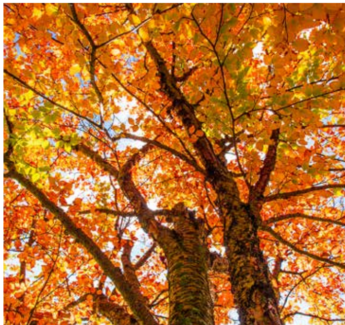
An example of autumn colour

This leads from Beacon Avenue and will have ornamental weathered steel gates, leading to an informal area of open space for casual play and leisure. There will also be a roundabout with space for public art.