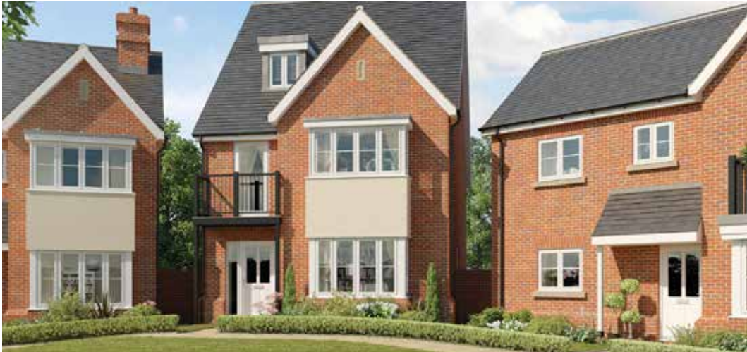
CGI of Bellway's 'Sixty Three' development at Kings Hill

Exciting new housing schemes are planned for the new residential neighbourhood, which are currently going through planning.