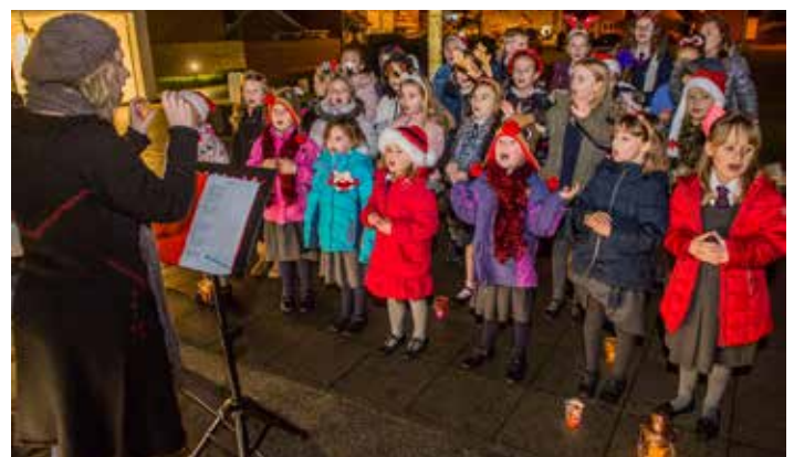
Christmas carols in Liberty Square 2016

For more information visit https://www.salvationarmy.org.uk/christmas-present-appeal . If you can't make the event you can also donate presents at the Vicarage before the event or at the St Gabriel's toy Service on Sunday 3rd December 10am.