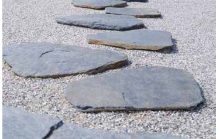
Indicative landscape elements