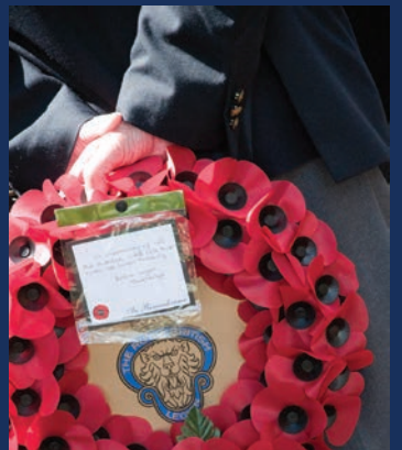
Poppy wreath laid by the Tonbridge Branch of the Royal British Legion