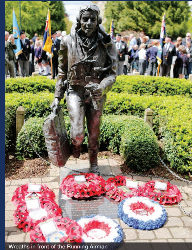
Wreaths in front of the Running Airman