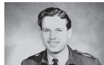
Wing Commander Guy Gibson VC DSO* DFC*

out, only 77 returned. Wing Commander Gibson was awarded the Victoria Cross for his bravery during the raid. Kings Hill's connection with the mission is through Guy Gibson, who served with 29 Squadron based at RAF West Malling (now Kings Hill) in 1941/2. He loved his time there and said: 'Of all the airfields in Great Britain, here, many say, including myself, we have the most pleasant.'