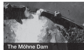
The Möhne Dam