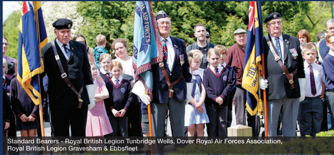
Standard Bearers - Royal British Legion Tunbridge Wells, Dover Royal Air Forces Association, Royal British Legion Gravesham & Ebbsfleet