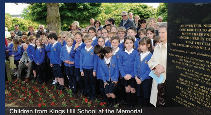
Children from Kings Hill School at the Memorial