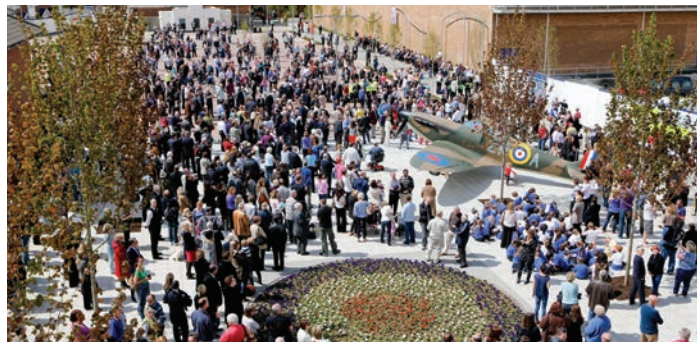
Crowds watching the Spitfire flypast

After the Service hundreds of people – including many children – gathered in the sunshine to watch a flypast by