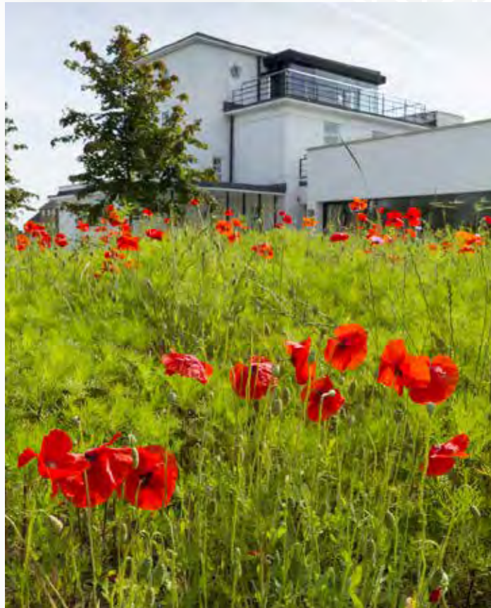
Poppies by the Control Tower

"It is a real team effort and so exciting to have everyone's hard work recognised in this