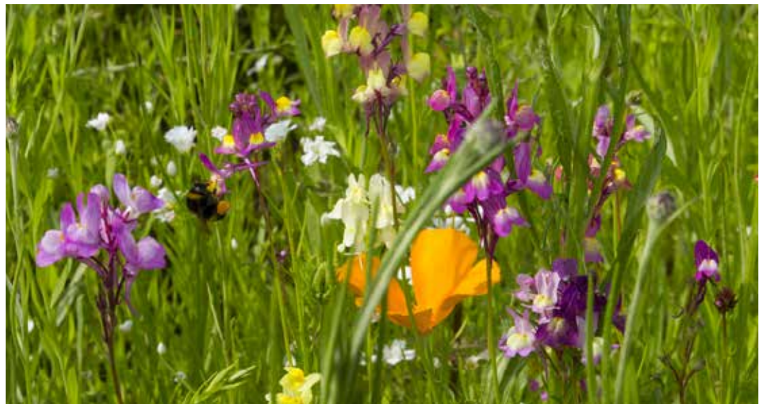
The new park will be planted with swathes of wild flowers

Now all the fine-tuning on the plans for the new Kings Hill park has been completed, the initial earthworks have begun, which will create the layout and contouring of the land.