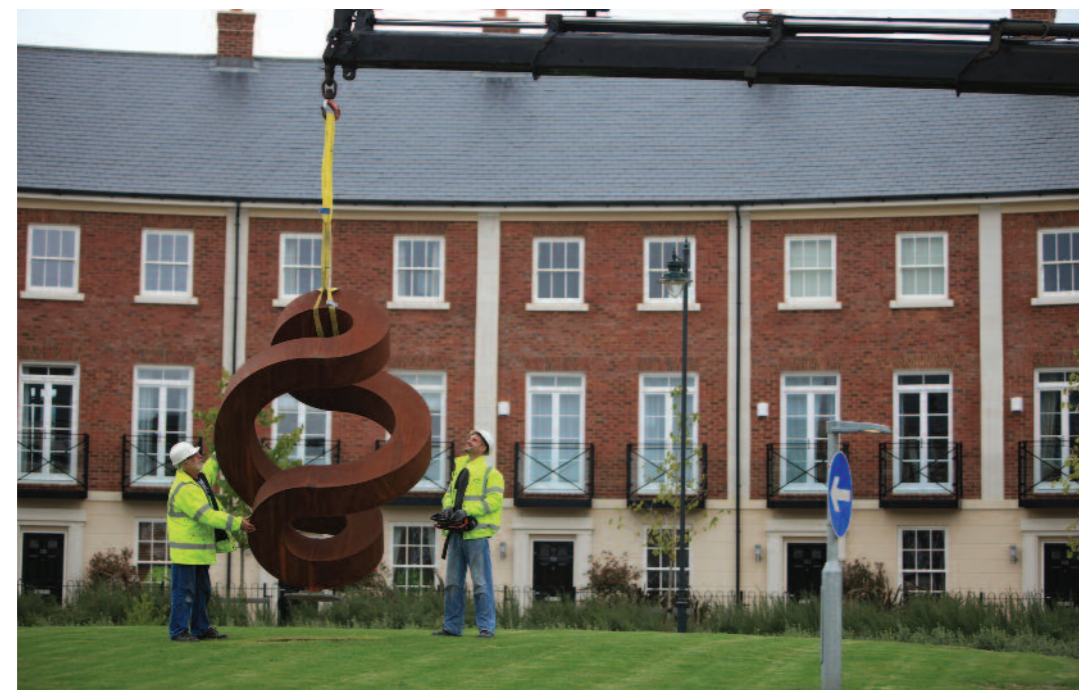
The sculpture being installed

Proposals for the management of the completed facility will be formalised over the next few months with Kings Hill Parish Council and the football club.