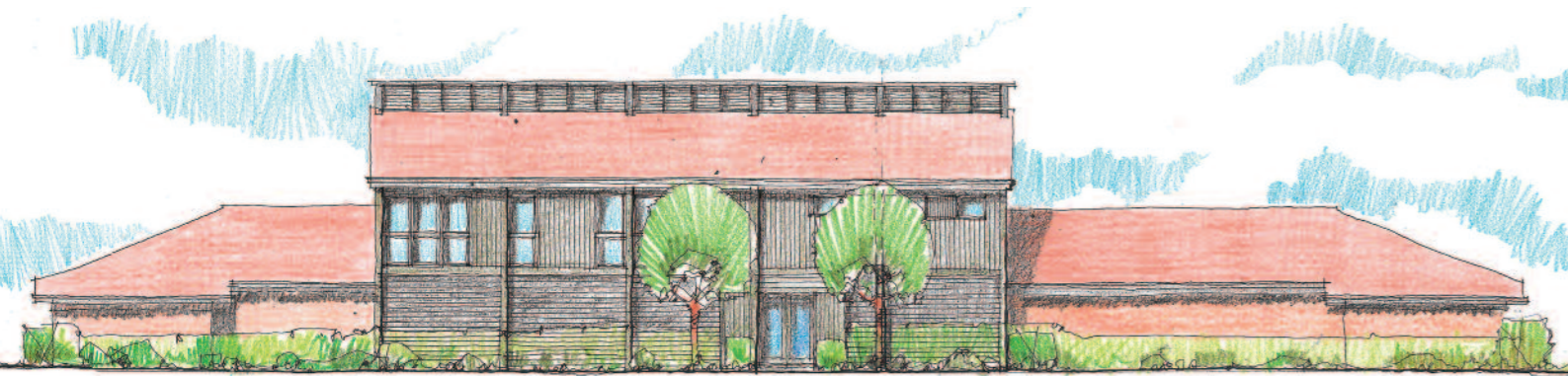
Architect's impression of the new pavilion