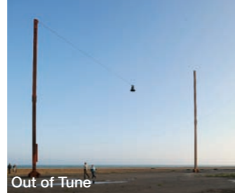
Out of Tune

We are delighted that design guru Wayne Hemingway has chaired the judging panel for the re-launched Liberty Kent Public Art Award (formerly the Rouse Kent Public Art Award).