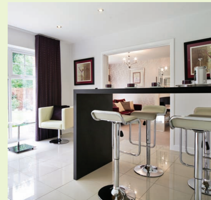
Inside the five-bedroom Merryworth detached home

Encouragingly, house prices in the area are holding up well, with West Malling showing the sixth highest percentage increase nationally with property prices increasing 8% since the winter. The borough has also been named one of the best places to live in rural