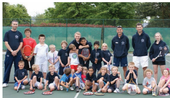
Children and coaching staff from the Kings Hill Tennis Academy

The Kings Hill Tennis Academy operates from within the David Lloyd centre and is for children aged from four to sixteen who are members of the club. Anyone interested in finding out more should