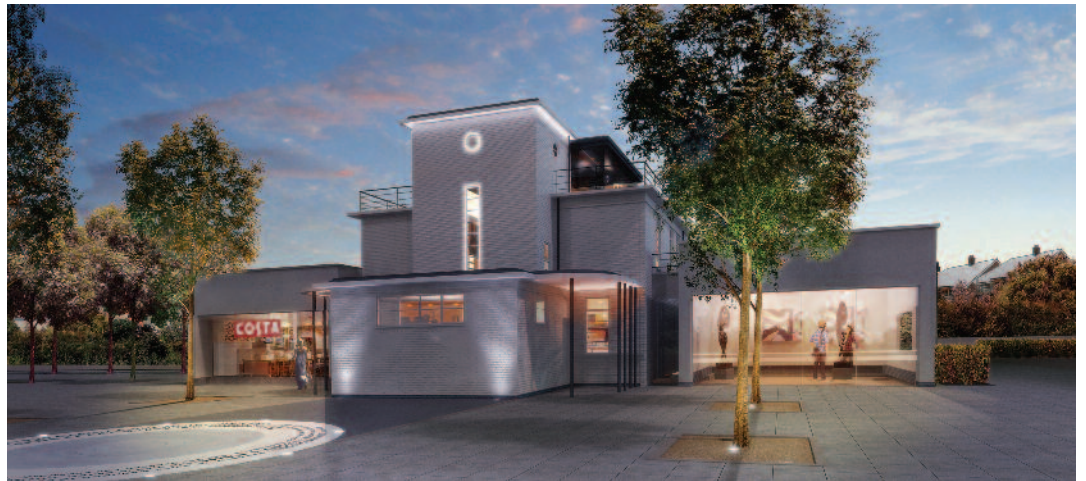
Work on the Art Deco Grade II listed building is due to be completed by the end of the year

Work is continuing to progress well on the refurbishment of the control tower with the two single storey extensions. One of the new extensions will house a cultural centre and the other, together with the whole of the ground floor of the central building, will