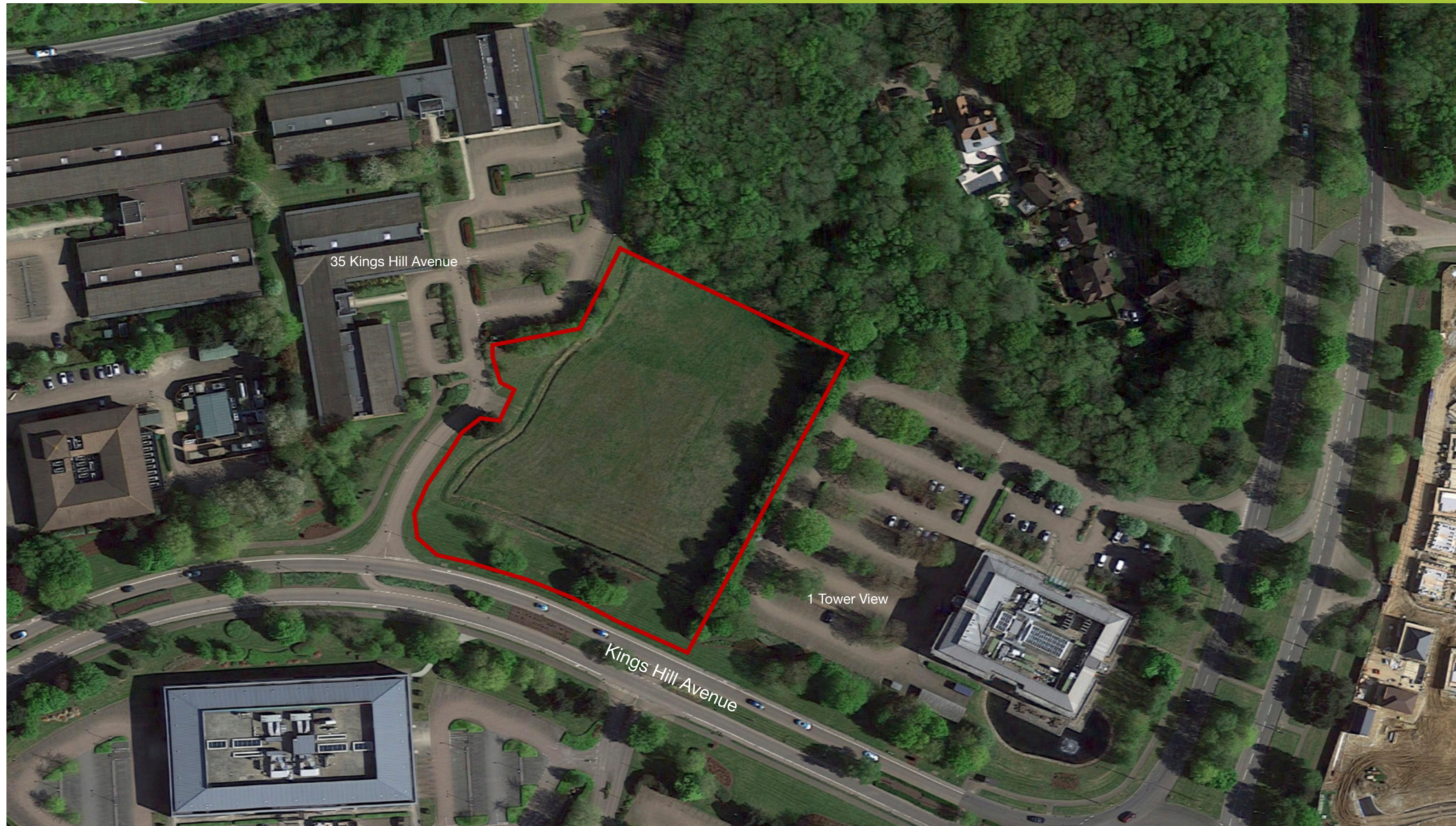
Aerial view of Site 5.1