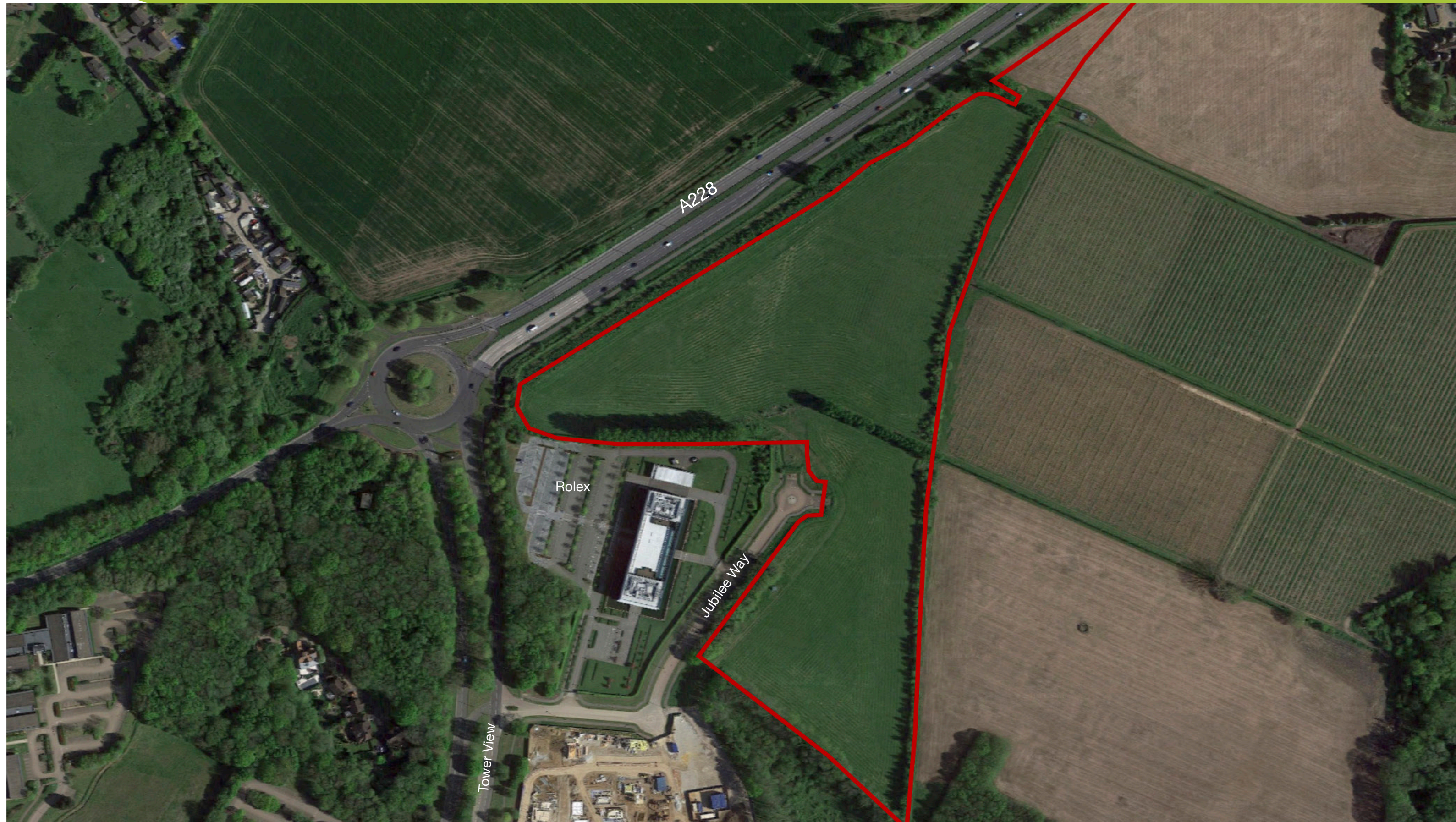
Aerial view of Site 5.2 & 5.3