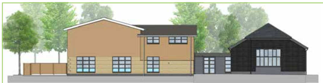
CGI of the new extension