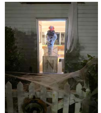
Best Dressed House – Charlotte

We'd like to congratulate the winners on their wonderful creations pictured here!