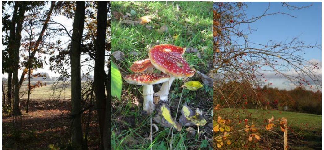
Warren Woods, Kings Hill

The gardening team ALWAYS do an amazing job and are probably never thanked enough. But, at the moment, this is more valued than ever. It is helping spirits be lifted, supporting people's mental health and just allowing people to escape for a short period. Please pass on our gratitude. Thank you.