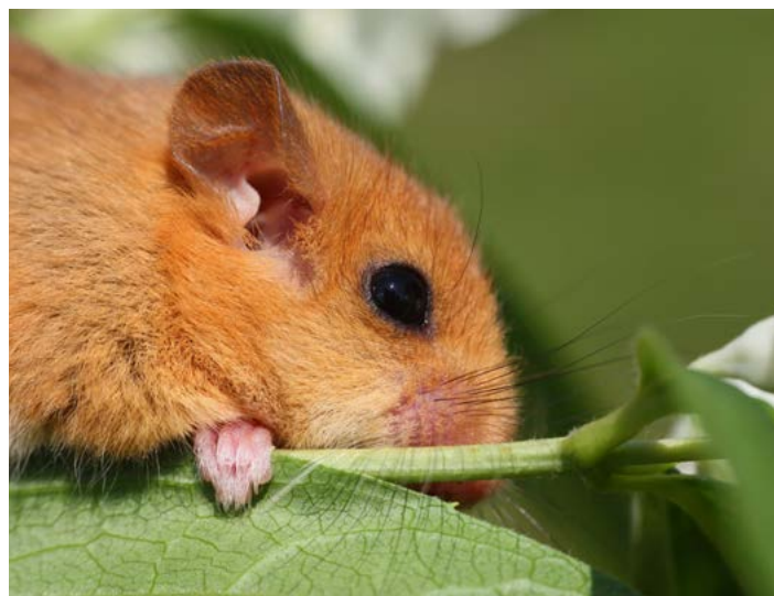
Dormice are protected in the UK

The safeguarding and proactive conservation management of the woodlands, along with linking areas of heath grassland, hedgerows and thickets, mainly around the periphery of Kings Hill, is vitally important in promoting biodiversity. The primary management objective is to enhance habitat