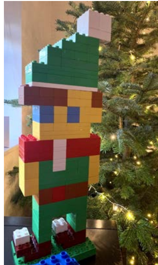
Elves can be made from anything and everything! Here is a lego elf, made by Bricks 4 Kidz, Kings Hill

Entry fee is £3, payable online. All monies raised will go towards the children of Kings Hill School. You will also be automatically entered in to a free prize draw to win a Luxury Christmas Hamper.