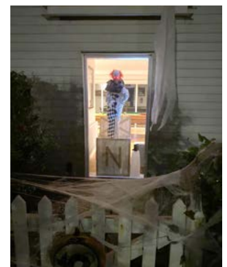
Best Dressed House – Charlotte

We'd like to congratulate the winners on their wonderful creations pictured here!