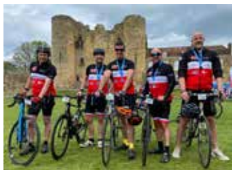
Kings Hill Wheelers, Tonbridge Castle 100 event.