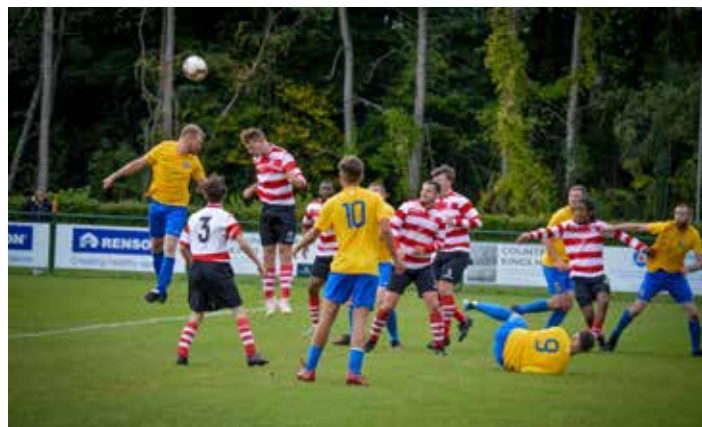
KHFC in action.

Further development by Liberty, has started and will see the addition of more changing rooms, 2 tennis and 2 dual use courts (with all having the ability to be marked out for both tennis and netball, as demand dictates), a trim