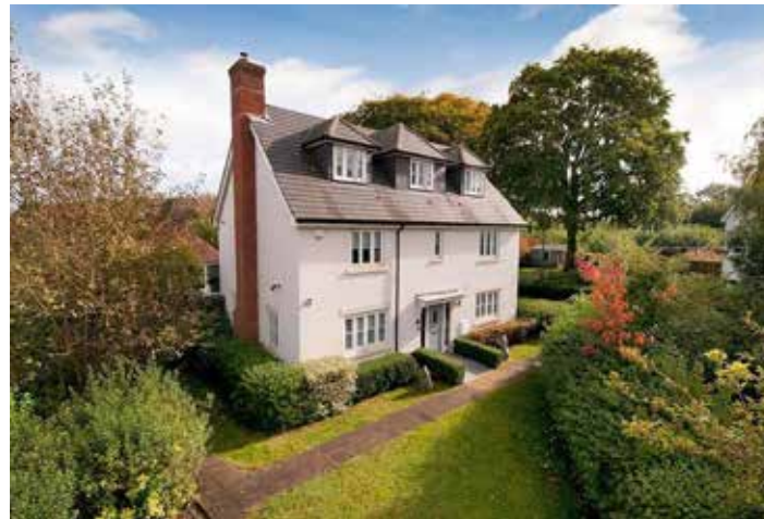
Kings Hill, West Malling, Kent

Kings Hill was featured in two popular publications in May - testament to its enduring appeal. Here is a brief summary of the articles and links to the full articles.